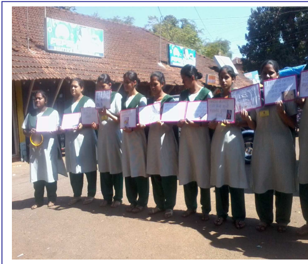
Students participating in the Voluntary Blood Donation campaign