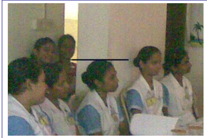
Nurses actively participating in the extempore

An extempore was conducted for the students on various topics related to HIV and AIDS. The students were given a minute to prepare and another minute to speak. They participated with full zeal and the winners were awarded.