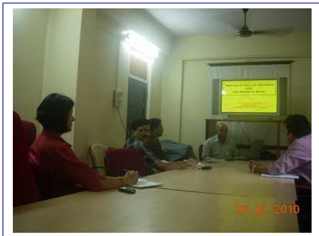
Doctors undergoing A.F.I .H. from DG FASLI, Mumbai attending the training programme