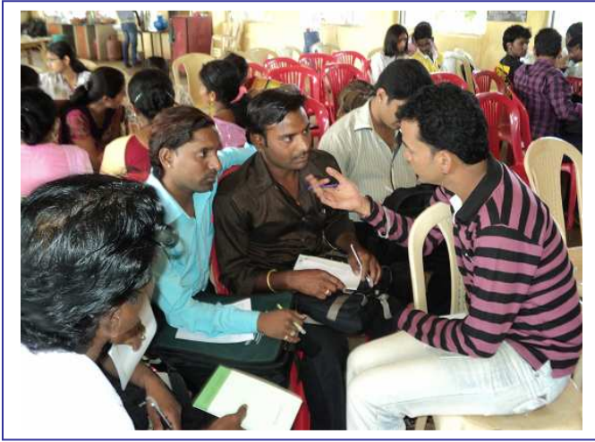
Peer Educators involved in group session