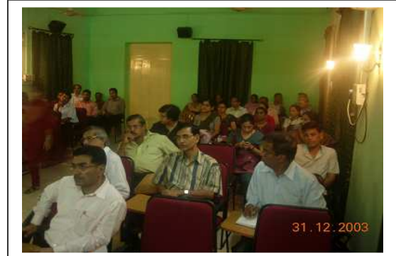
Doctors under DHS attending the C.M.E. at Asilo Hospital, Mapusa (L.H.S.) and at Hospicio Hospital, Margao (R.H.S.)