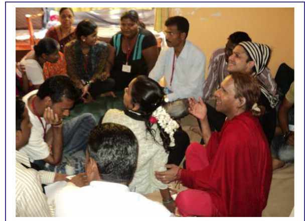
Peer Educators participating in a group discussion.