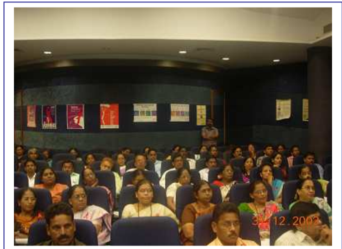
Supervisory Staff of DHS attending the training programme