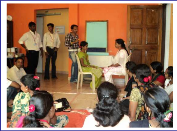
Peer Educators conducting a mock session