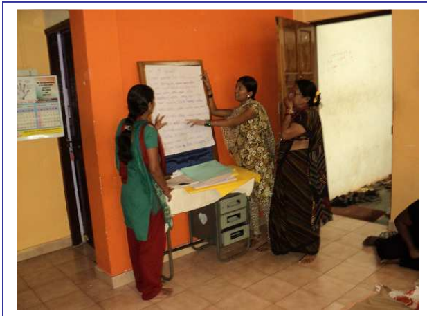
Peer Educators delivering a presentation on 'Role and Responsibility of Peer'