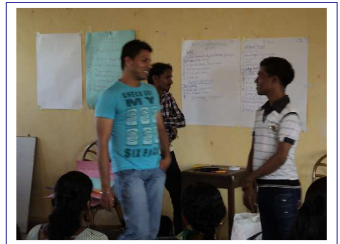
Peer Educators conducting a mock session