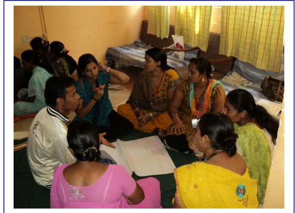
Peer Educators at Group Work