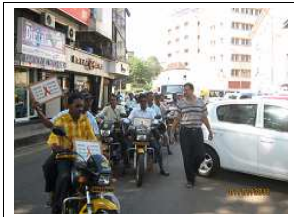
The members of the Association participating in the rally.