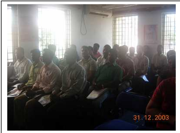
Police personnel attending the workshop.