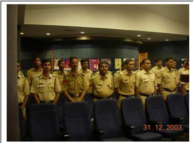
North Goa Police personnel listening to the song 'Itni Shakti Hume Dena Daata'.