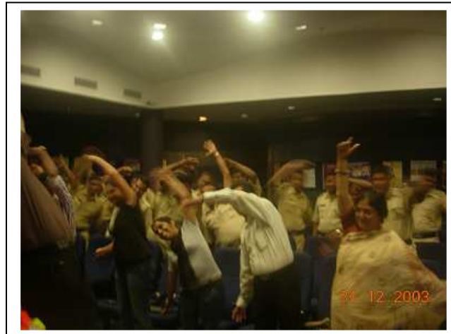
An exercise to refresh is being performed by the participants.