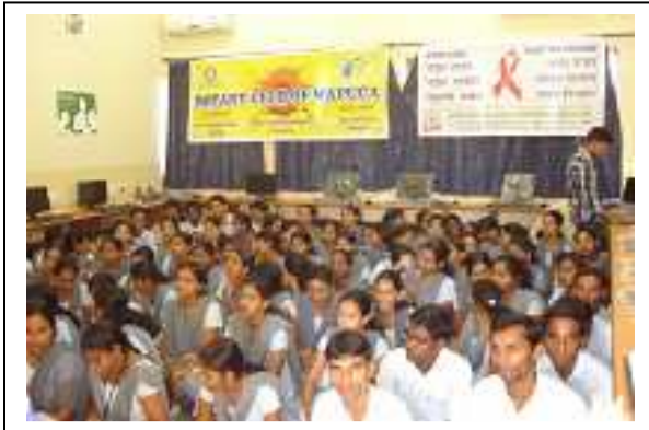
D. Ed teachers attending the function.