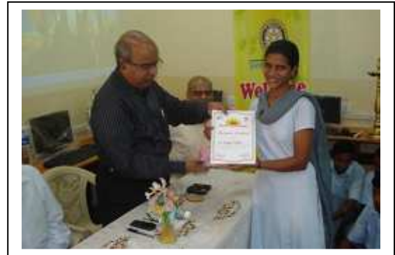
Participation certificate is being presented to one of the D. Ed teacher.