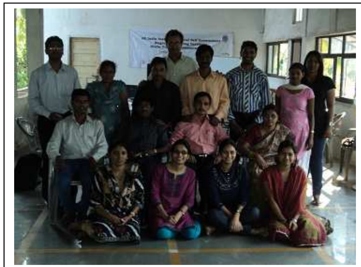
Participants at the training programme for TI counselors