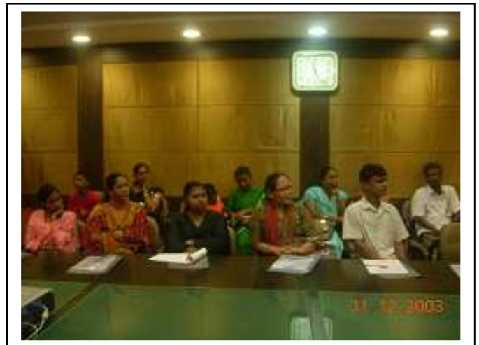
Participants attending the workshop