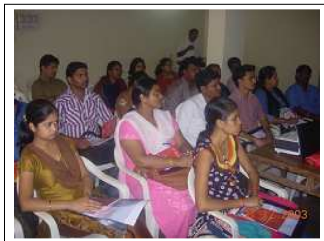
Project Managers of NGOs and Lab Technicians/Counselors in a practical session