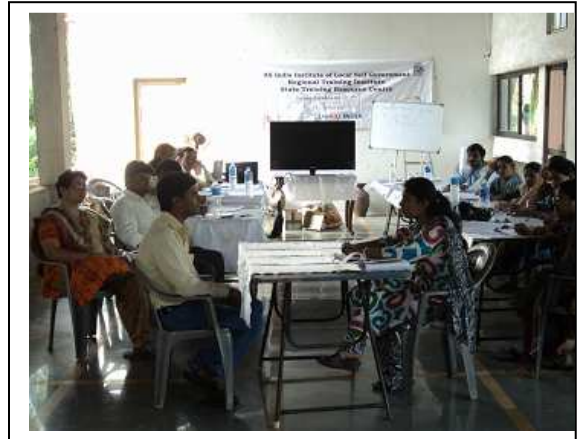
Participants at the training programme