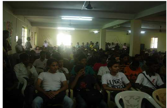
Students attending the programme.