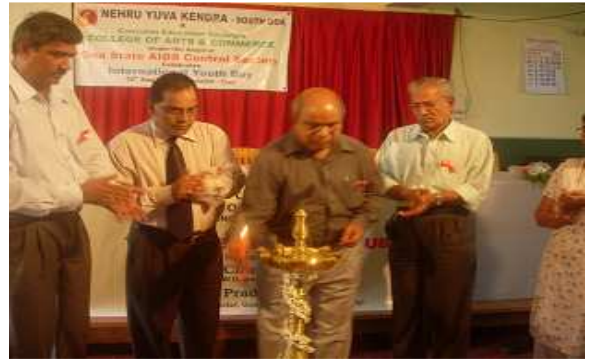
Inauguration of RRC and International Youth Day