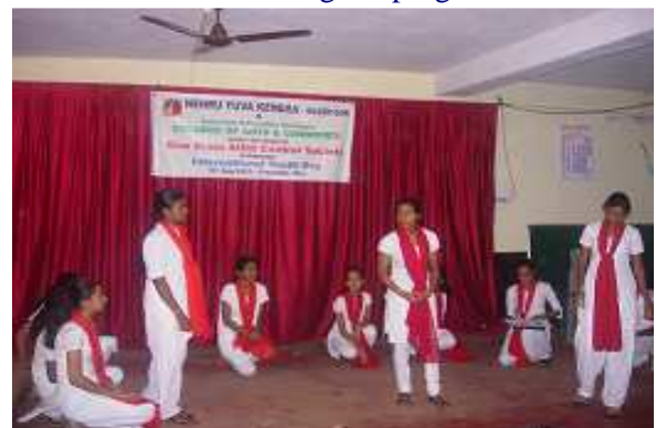
Street Play Competition at International Youth Day