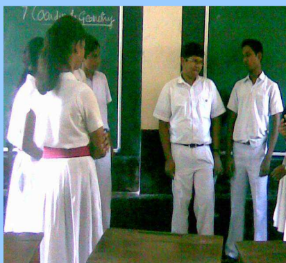
Students planning to enact a skit.