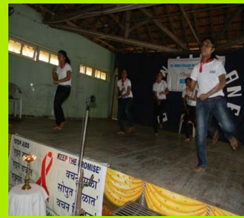
Fr. Agnel College of Arts, Commerce and B.C.A, Pilar students performing a special dance program on spreading awareness on HIV/AIDS prevention.