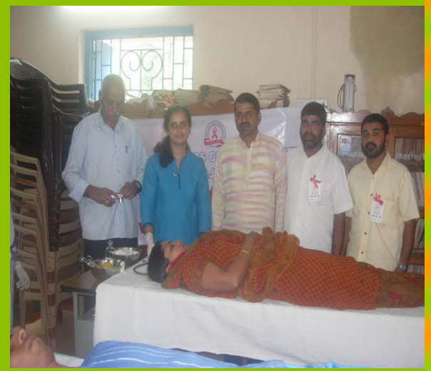
Blood Donation Camp conducted at Sarvan, Bicholim.

Sessions were given to the NSS Programme Officers and the Principals of + Two Level on HIV/AIDS and the Goan Scenario at the Annual Meets organized by Directorate of Sports and Youth Affairs at Conference Hall, Miramar Residency on 16th July 2010 and 23 rd July 2010 respectively. They were also requested to establish the Red Ribbon Club in their respective institute for their students. They were told to contact the Consultant (Youth Affairs) at the Goa SACS office for further details. Letters and Red Ribbon Club brochures were distributed to them at the end of the session. The Project Director also requested the Principals who have already established the Club to continue conducting activities to generate awareness about HIV/AIDS into the community.