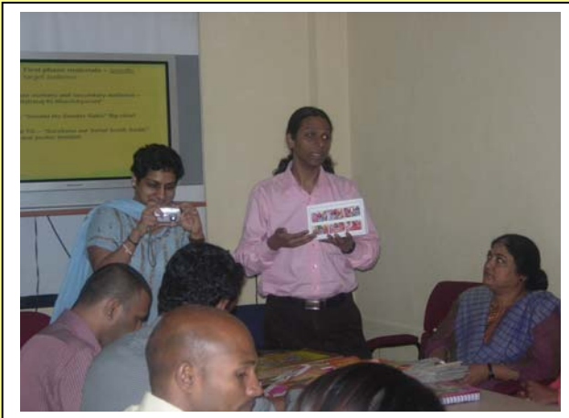
Displaying IEC materials