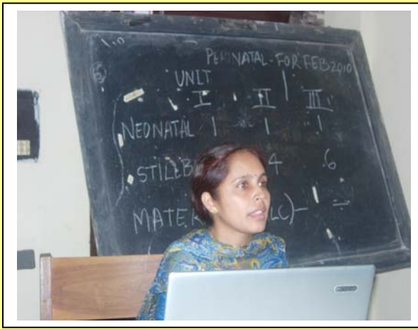
DD, STI facilitating the session in the dept. of Gynaecology at GMC