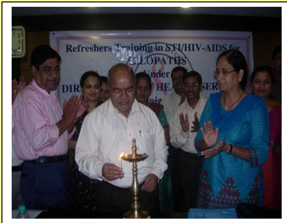
Project Director inaugurating the training for allopaths under DHS at Secretariat, Porvorim