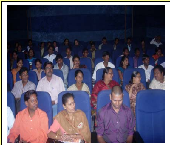
TI NGOs present during ESRM