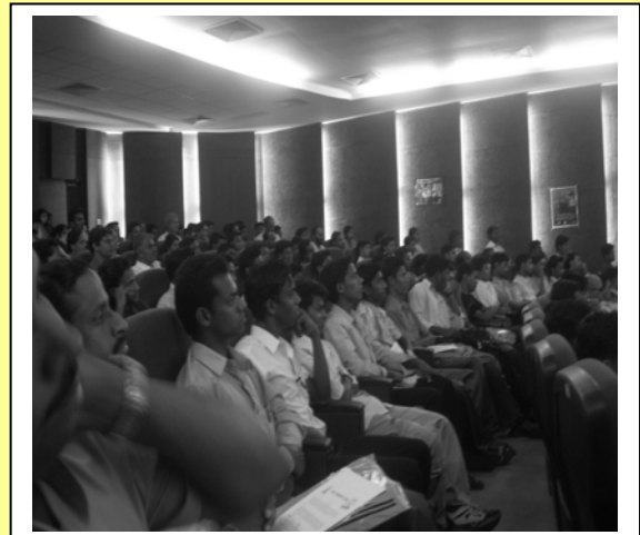
Participants attending the programme