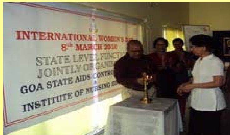
Project Director inaugurating the Red Ribbon Club