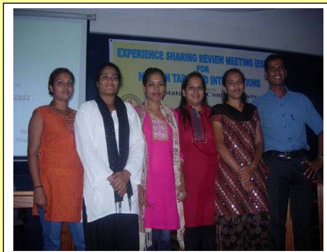
TI NGOs participating in the ESRM function