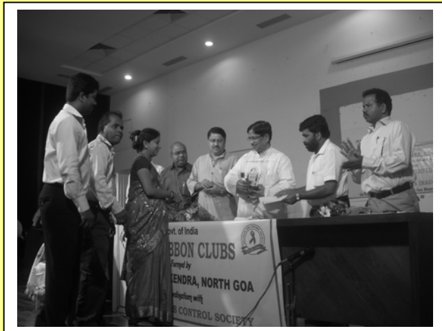
Shri Shantaram Naik, M.P., Rajya Sabha distributing certificates