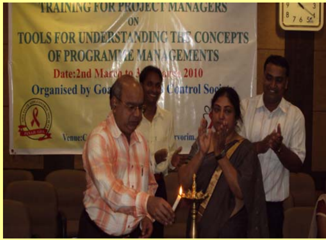
Project Director inaugurating the training program