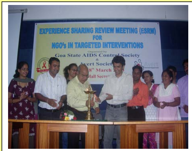
Project Director inaugurating the ESRM function