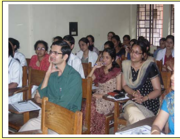
Participants attending the session