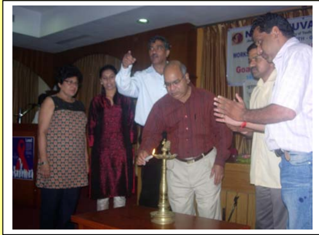
Project Director inaugurating the program at Rabindra Bhavan, Margao