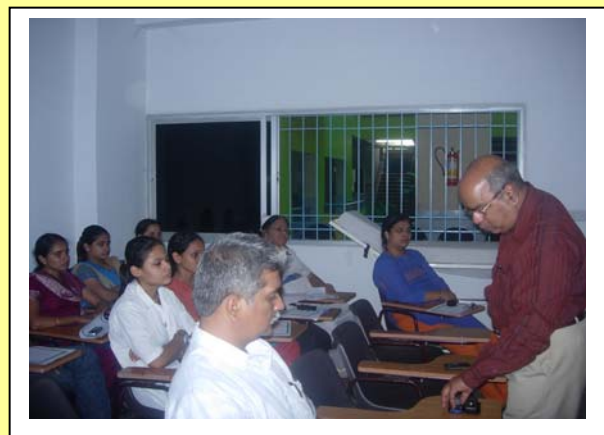
Project Director facilitating the session in the dept. of Venerology & Dermatology