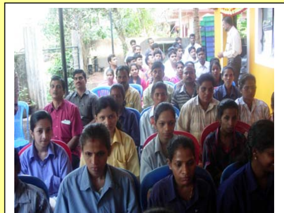
Participants attending the training at Mangeshi