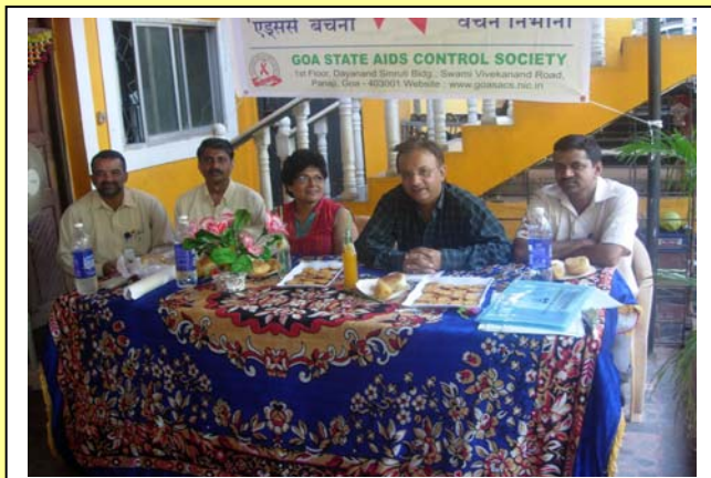
Training on HIV/AIDS awareness at Mangeshi