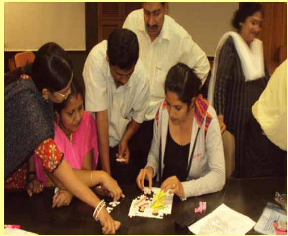
TI NGOs taking part in the activities