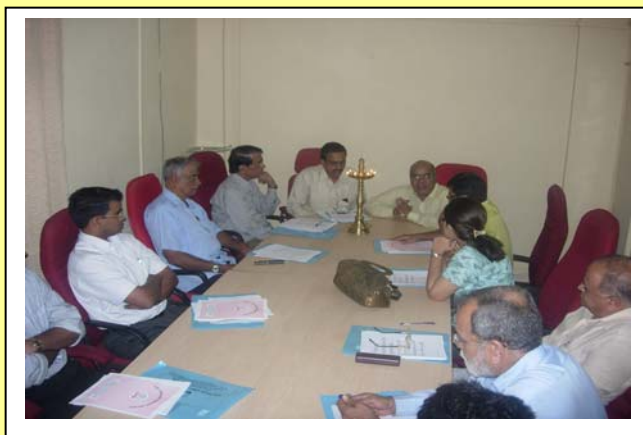
Training for PPPs under Link Workers' scheme at Goa SACS' Conference Hall

All the trainings & programmes were carried out under the Project Director's supervision and guidance.