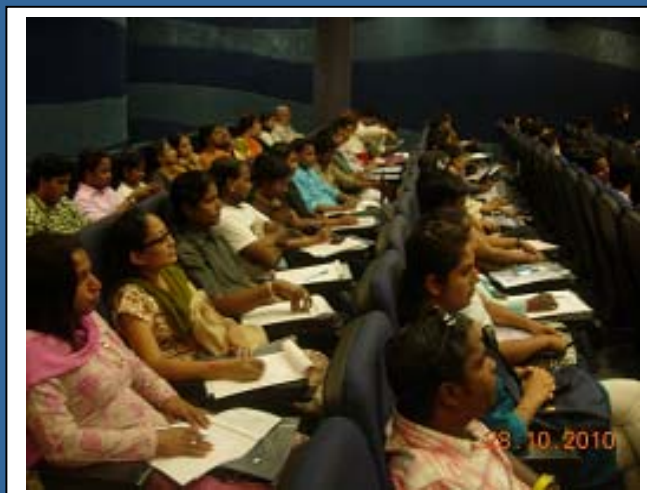
Participants for the ESRM programme.