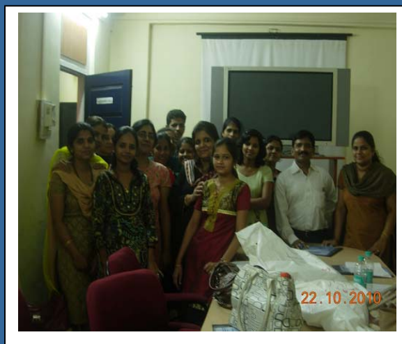
ICTC and ART Lab. Technicians attending the training program.