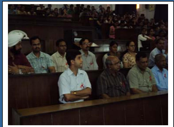
Audience at the screening of a short film on AIDS Awareness developed by RRC members.